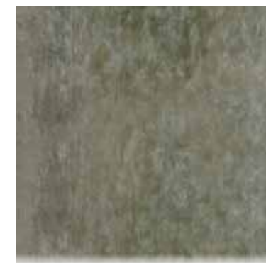
NS-442 Mystic Green