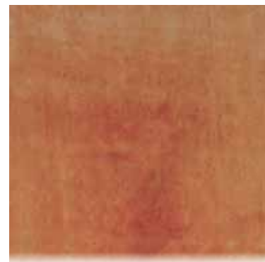
NS-107 Dark Buff