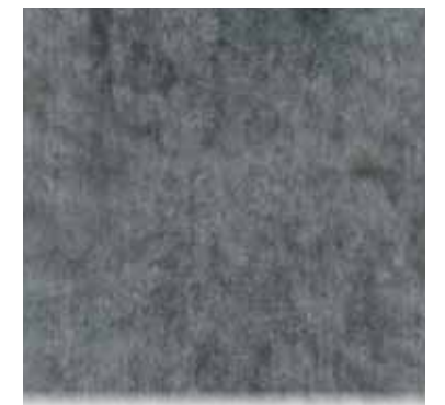
NS-520 Slate Blue