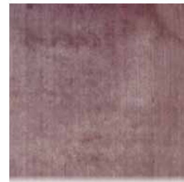
NS-621 Blue Hydrangea