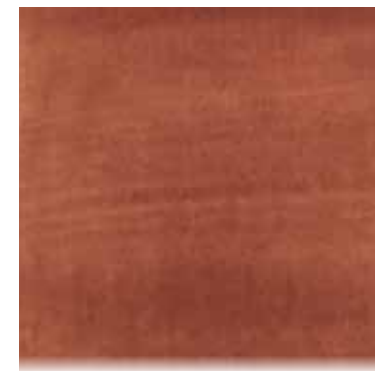
NS-180 Antique Bronze