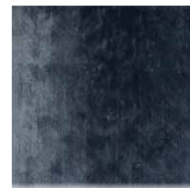
NS-681 Black Light