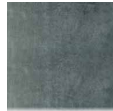
NS-519 Seal Gray