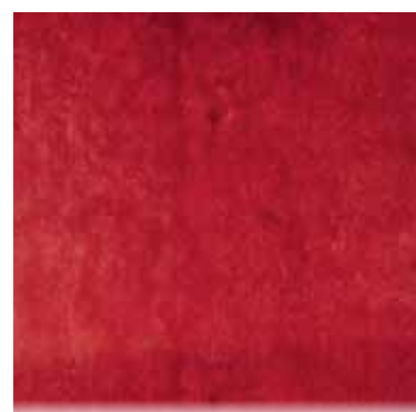
NS-259 Poppy Red