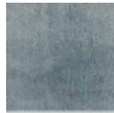
NS-534 Cadet Blue