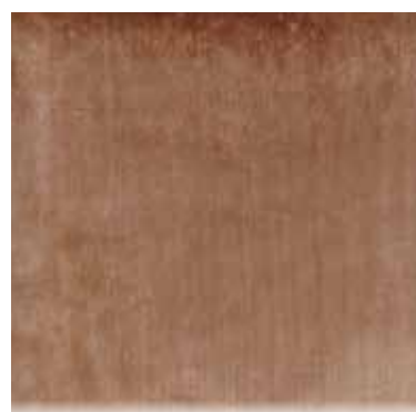
NS-131 Milk Chocolate