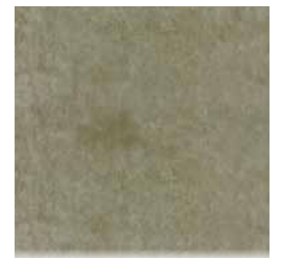
NS-433 Sage Green