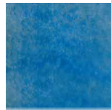
NS-511I Cornflower Blue Not for Outdoor Use