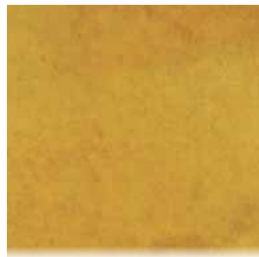
NS-321 Lemon Grass